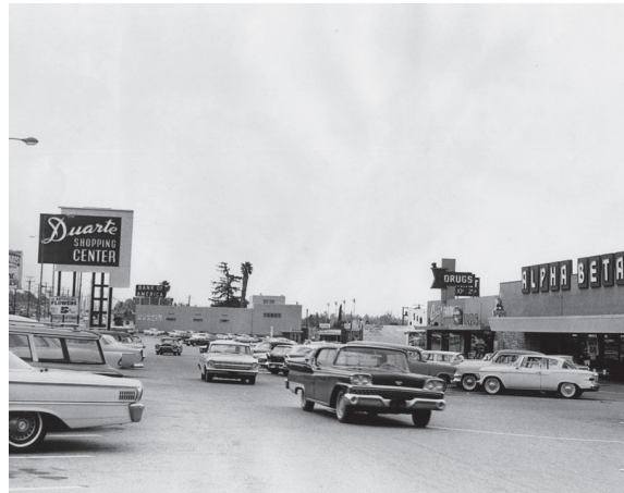
Duarte Shopping Center, 1964