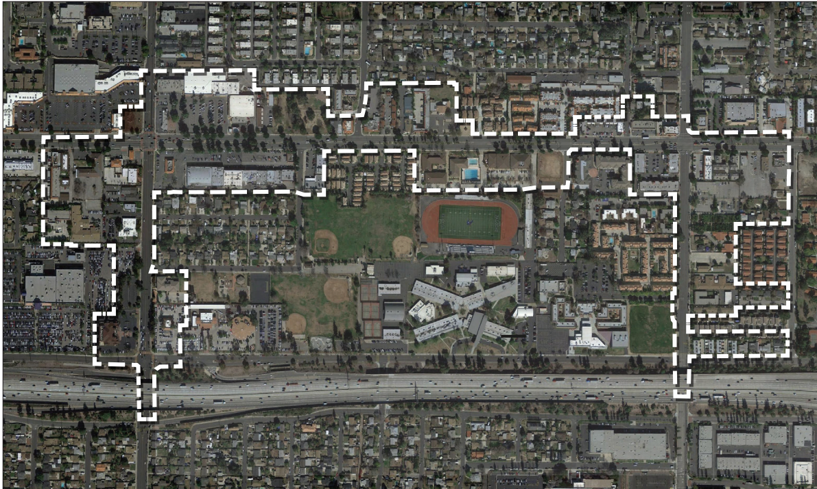
Aerial view of the Specific Plan area, 2016

Duarte's Town Center generally extends north from I-210 along Highland Avenue at the eastern boundary and Buena Vista Street at the western boundary to Huntington Drive. Huntington Drive and the parcels on the north and south sides of Huntington Drive span the Specific Plan area. The plan area encompasses approximately 75 net acres.