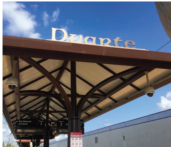
Duarte Metro Gold Line Station, located just south of the Specific Plan area