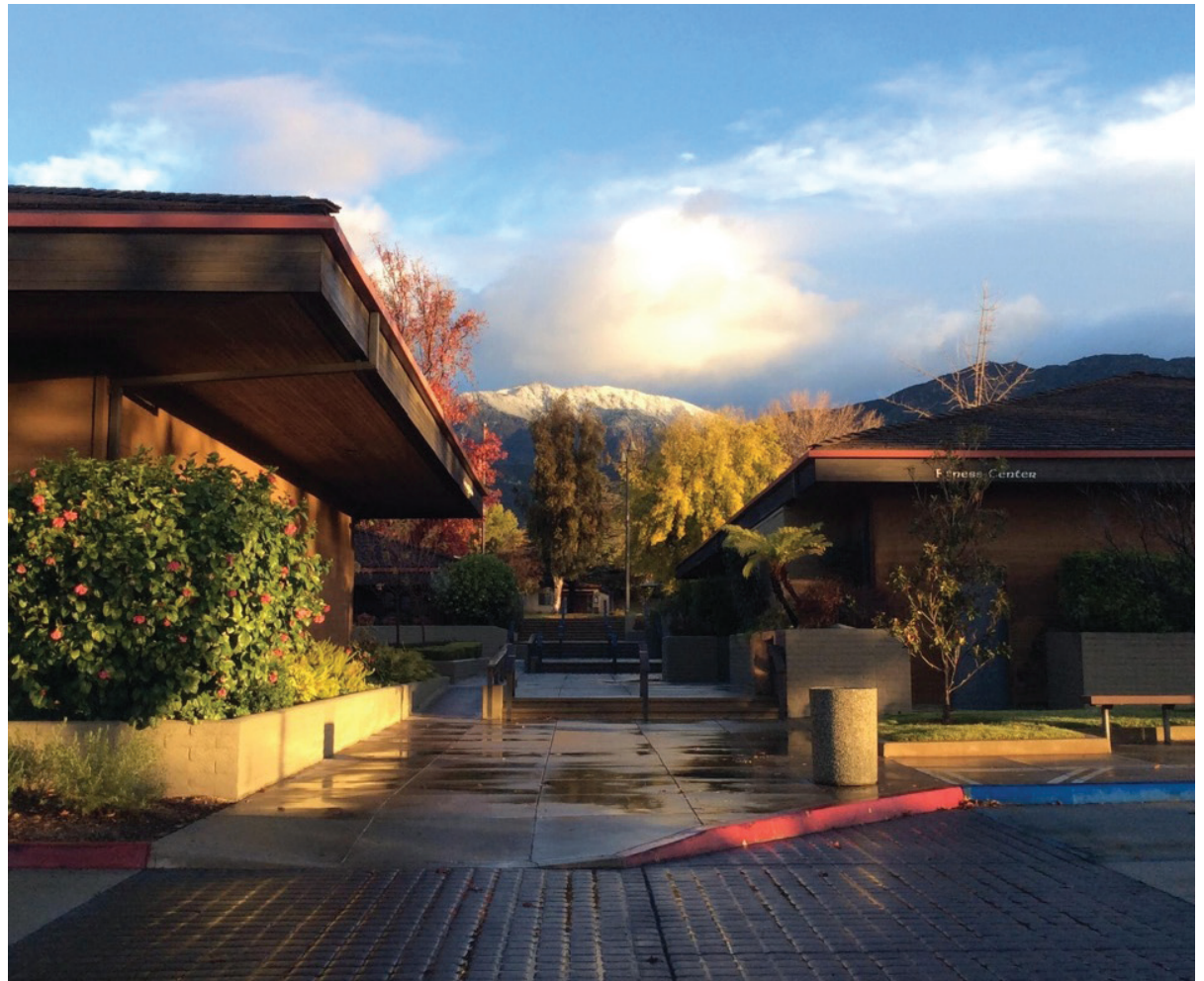
Duarte City Hall (view to the north), showing the base of the Angeles National Forest in the distance

These elements will serve as an impetus and guide for tangible change to the Town Center. This document represents the community's cohesive vision and provides solutions to transform the area into a memorable, vibrant, pedestrian-oriented, and interconnected Town Center.