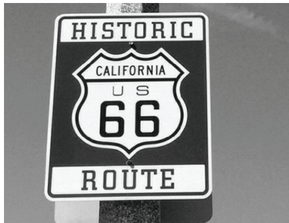
Historic Route 66 (Huntington Drive in Duarte)