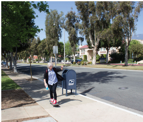
The public right of way in front of City Hall on Huntington

The Duarte Town Center Specific Plan aims to be truly transformative. It implements the Town Center Vision , outlines development standards and design guidelines to support the vision, and identifies action steps to achieve key objectives.