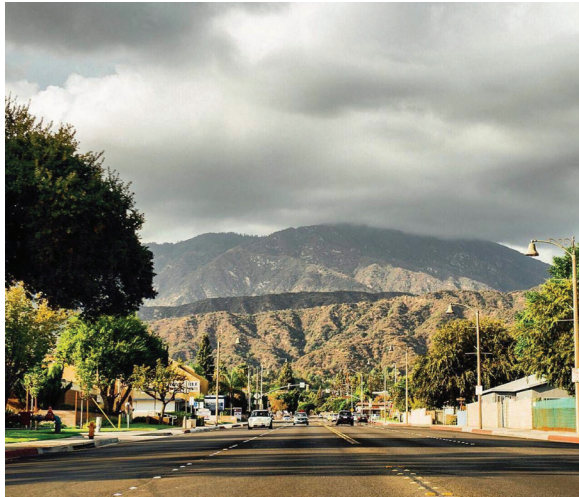
Buena Vista Street (view to the north)