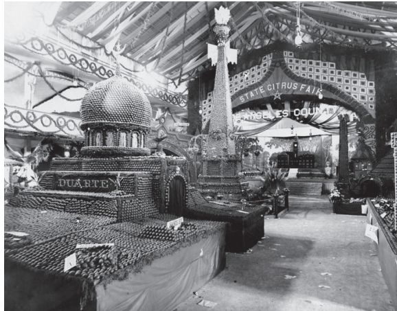
Duarte's State Citrus Fair exhibit, 1891