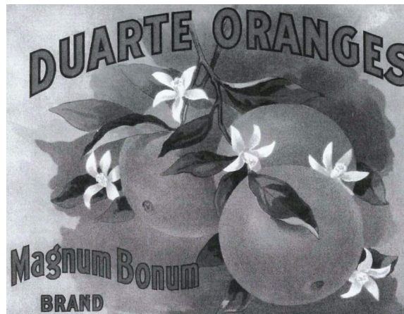
Duarte's historic citrus groves