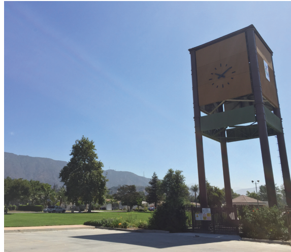
Duarte Clock Tower located at the Teen Center

Line Station, the original Town Center concept has been expanded to also include Highland Avenue in this new planning effort. The expansion will accommodate enhanced mobility options to and from the Gold Line station area, as well as promote additional transit-oriented development opportunities in Duarte.